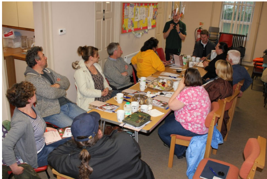
Local food demo by staff at the Caerphilly Food Festival