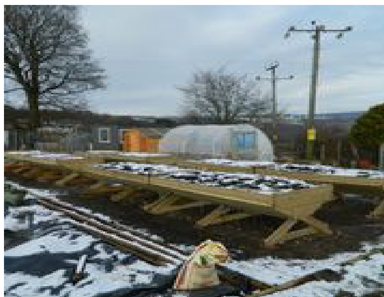
The completed project – ground levelled, 8 raised beds made, 1 polytunnel and 1 shed installed

The Allotment Society themselves carried out the project work with Healthy Villages despite heavy snow and advancing years! The group considered the project a massive success and have written a letter to thank the Healthy Villages for helping to achieve their goal.