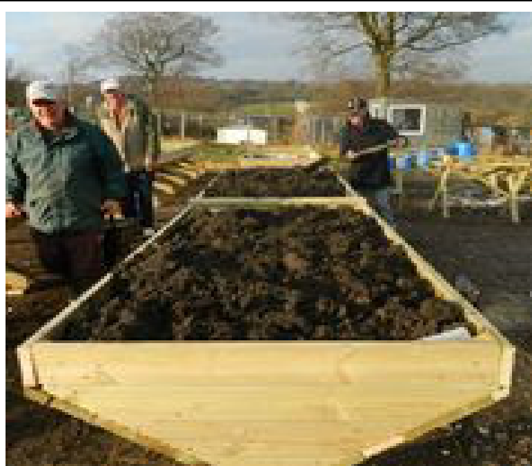
The ‘manger’ raised beds that were designed by an 18 year old volunteer

The team designed and installed raised beds at Trinant Allotment with Pentwyn Allotment Society . Pentwyn Allotment Society had been attempting to develop a community plot for several years but had several delays from causes such as lack of funding, failing deadlines and restructuring of staff from various supporting organisations.